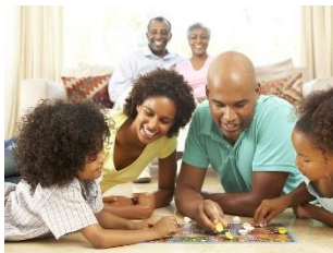
Trinity Game Day / Cookie Exchange

SEND THEM A BIRTHDAY CARD OR CALL THEM WITH YOUR GREETING. WE PRAY GOD GRANTS THEM MANY MORE YEARS IN THEIR PILGRIMAGE.